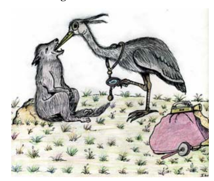
The Wolf and the Heron

The Wolf had swallowed a fishbone and went to ask the heron to pull it out of his throat. "I will reward you handsomely for your help," he promised the heron.